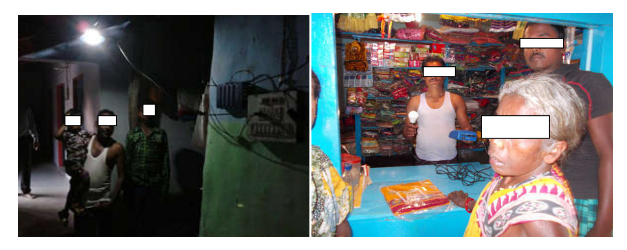
Fig. 2. Solar operated lights installed in different tribal households