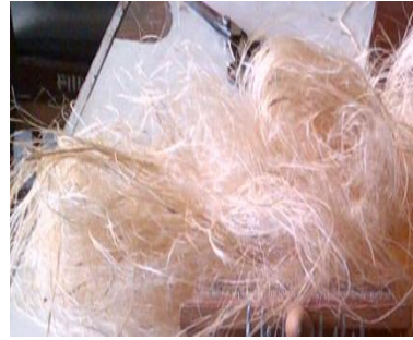
Fig. 3. Extracted and modified kenaf blast fiber