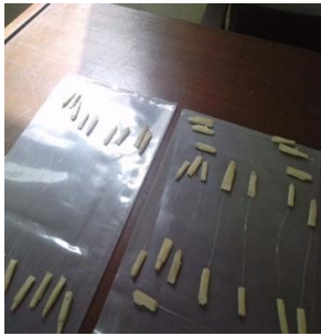
Fig. 4. Fiber sampling