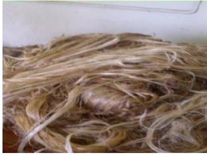
Fig. 2. Extracted kenaf blast fiber