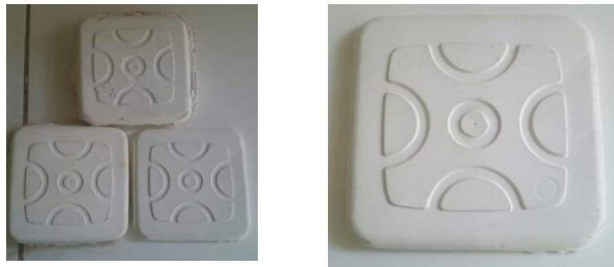
Fig. 7. Experimental products