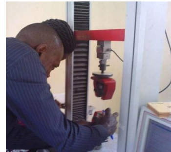
Fig. 6. Mechanical testing (Tensile strength)