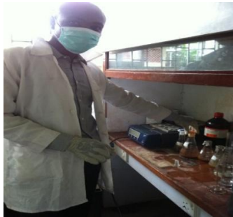
Fig. 5. Chemical modification