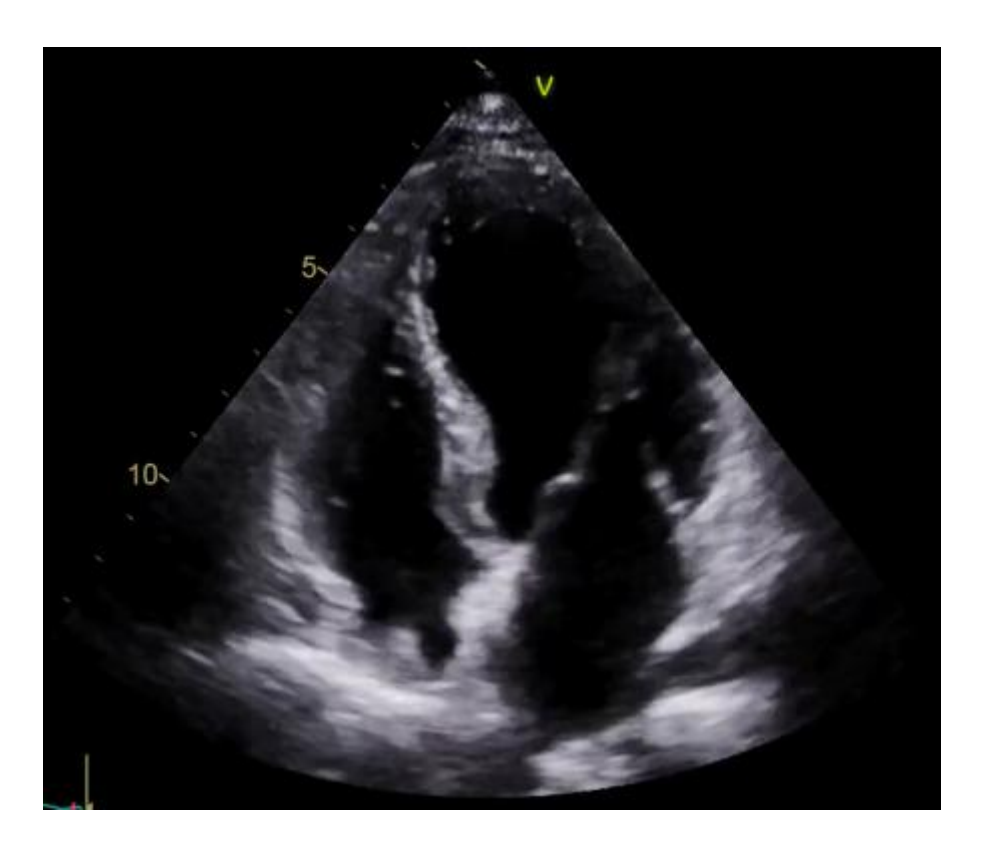
Fig. 3. Transthoracic echocardiography demonstrating characteristic apical ballooning of the left ventricle

The patient was managed with supportive care (Oxygen therapy, Monitoring: Continuous cardiac monitoring and frequent assessments of vital signs, Fluid management)and beta-blocker therapy (bisoprolol 2.5mg increased to 5mg after 1 week), and her symptoms improved gradually over the next few days. After 17 days, Follow-up imaging showed complete resolution of her ventricular dysfunction, with normalization of left ventricular ejection fraction. The patient was discharged with instructions to follow up with her primary care physician and to avoid triggers for stress.