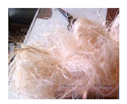
Fig. 3. Extracted and modified kenaf blast fiber