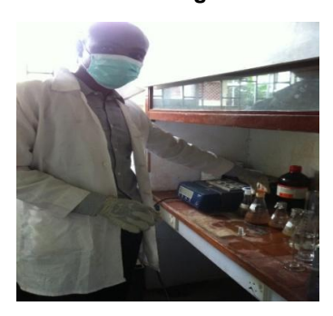
Fig. 5. Chemical modification