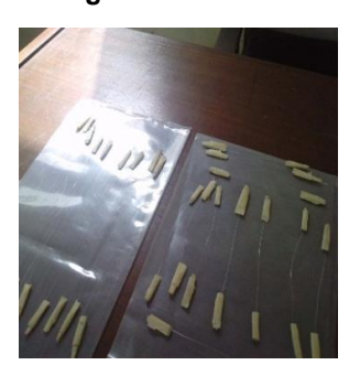
Fig. 4. Fiber sampling