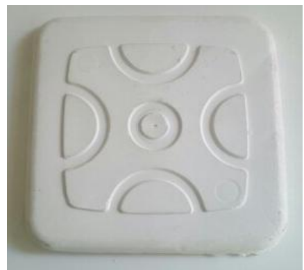
Fig. 7. Experimental products