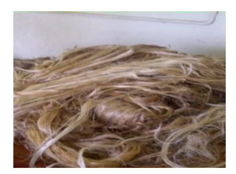
Fig. 2. Extracted kenaf blast fiber