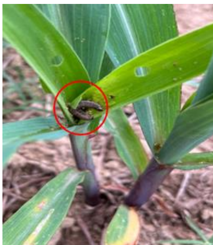
Fig. 3. NPV infected larvae before death