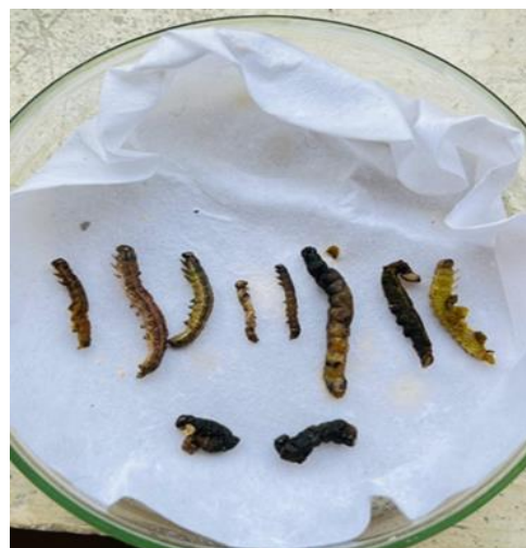
Fig. 4. Dead larvae from laboratory