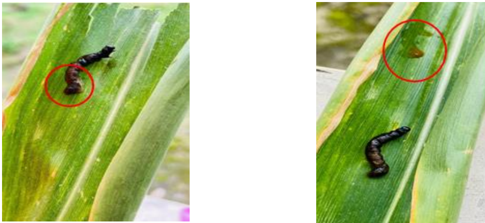
Fig. 2. Orange brown liquid discharge from body of larvae