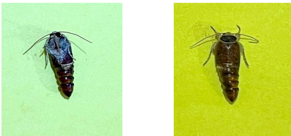
Fig. 5. Larval- pupal intermediates due to NPV infection