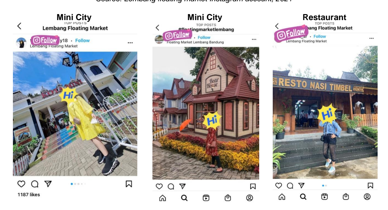
Fig. 2. Instagrammable attraction at Floating Market Lembang